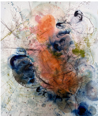
Decay and Decadence , 2010. 36 x 41.5 inches. Oil on canvas. $500.00.

“Better land management and agricultural practices enhance the ability of soils to store carbon.”