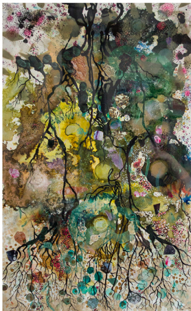
Visible Pores , 2020. Print: 17.5 x 22 inches. Framed: 24 x 28 inches. Acrylic, gouache, graphite, pigmented dye, ink, coffee and collaged photographs on paper. $450.00.

“More microbes in the soil enable plants to grow deeper root systems that allow them to tolerate drought better, and be more resistant to pests”