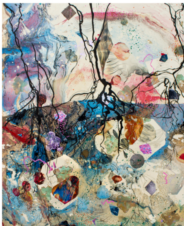
Fragmentation, 2020. Print: 18 x 29 inches. Framed: 22 x 32 inches. Acrylic, etching ink, graphite and collaged photographs on paper. $250.00.

"Soils remove about 25 percent of the world's fossil fuel emissions each year."