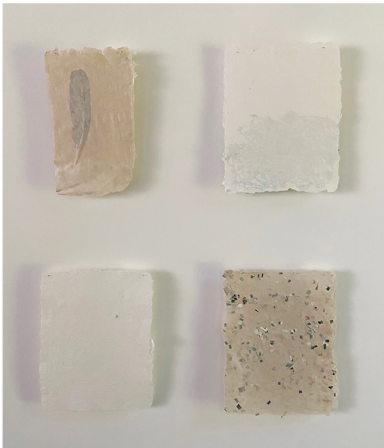
Great Groups Series no. 1-4 , 2020. see next page for sizes. Hand made paper with enclosures, LED lights, insect pins. Print: $75.00. each. (no1. Crow = NFS) (Lights are temporary installed).