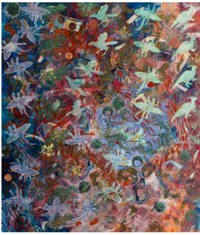
Abundance , 2020. 31 x 42 inches. Acrylic, oil pigment stick, collaged photographs on canvas. $800.00.