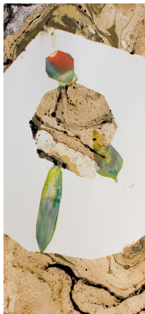
Thrust Fault Series , 2017. 8 x 17 inches. Monoprint, etching ink and enamel on paper. $100.00.