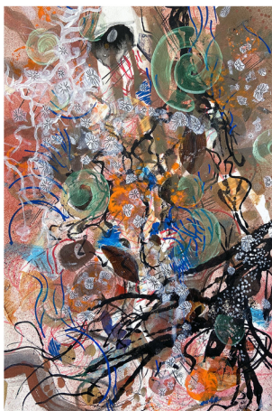
Subsurface Series: Recorded Microcosms, 2019-20. Print 12 x 18 inches. Framed: 16.5 x 23 inches. Acrylic, graphite, Lily pedals on paper. $200.00.