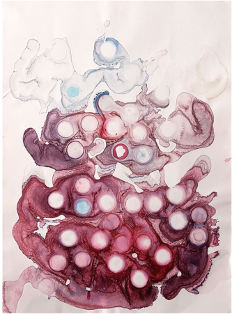
Evaporated Drawings Series: Conditions Testing , 2011. 22 x 30 inches. Ink, tea, and pigment dye on paper. Print: $250.00, with LEDS & inset pins: $300.00. (Lights are temporary installed).