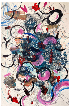
Subsurface Series: Found Fertility, 2017-20. Print 12 x 18 inches. Framed: 16.5 x 23 inches. Acrylic, graphite and pigmented wax on paper. $200.00.