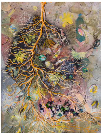
Systems of Energy and Nutrient Exchange , 2019-20. 18 x 24 inches. Acrylic, pigmented wax, recycled photograph emulsion, hand marbled paper, acrylic acetate and treasured 'bumper sticker' on canvas. $300.00.