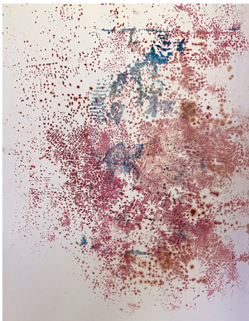
Proper Rituals , 2020. 22 x 36 inches. Monoprint, etching ink on paper, led lights, wire, insect pins. Print: $180.00, with LEDS & inset pins: $245.00. (Lights are temporary installed).