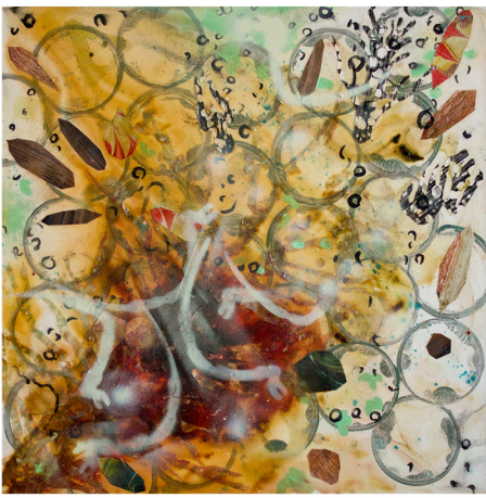
Ground Sample , 2020. 24 x 24 inches. Acrylic, gouache, collaged photographs, and Easter egg kit dye on canvas with acrylic matte finish. $200.00.