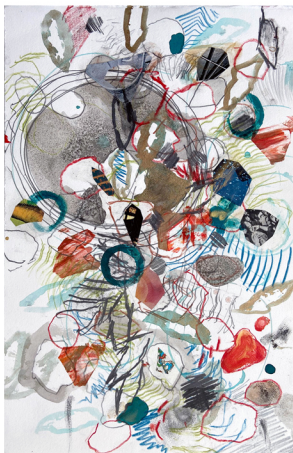
Subsurface Series: SOM Activity, 2019-20. Print 12 x 18 inches. Framed: 16.5 x 23 inches. Acrylic, graphite, pigmented wax, salt and collaged photographs on paper. $200.00.