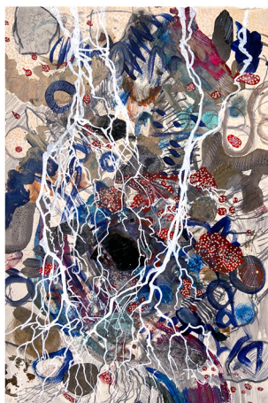
Subsurface Series: Sticky Compounds, Leach on Me, 2019-20. Print 12 x 18 inches. Framed: 16.5 x 23 inches. Acrylic, graphite, pigmented wax, salt and collaged photographs on paper. $200.00.