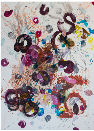
Atomic no. 2. , 2017. Print: 21 x 28 inches. Framed 25 x 32 inches. Ink, graphite, acrylic on paper. $450.00.