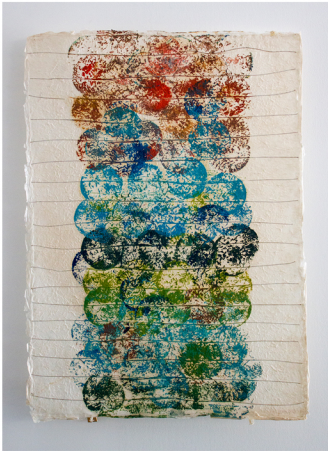
Morphology , 2020. 22 x 30 inches. Monoprint: etching Ink on hand made paper with plant stem enclosures, led lights, wire, insect pins. Print: $180.00, with LEDS & inset pins: $245.00. (Lights are temporary installed).

“More microbes in the soil enable plants to grow deeper root systems that allow them to tolerate drought better, and be more resistant to pests”