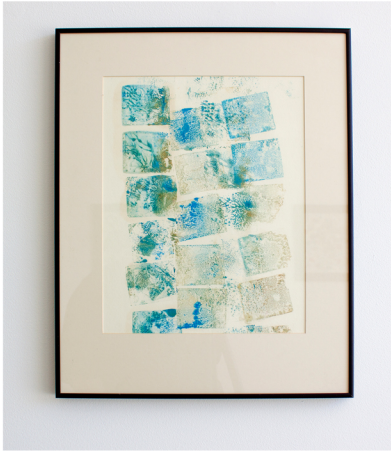
Thrust-fault, no.3 , 2013. Print: 11 x 14 inches. Framed: 16 x 20 inches. Monoprint, etching ink on paper. $175.00.